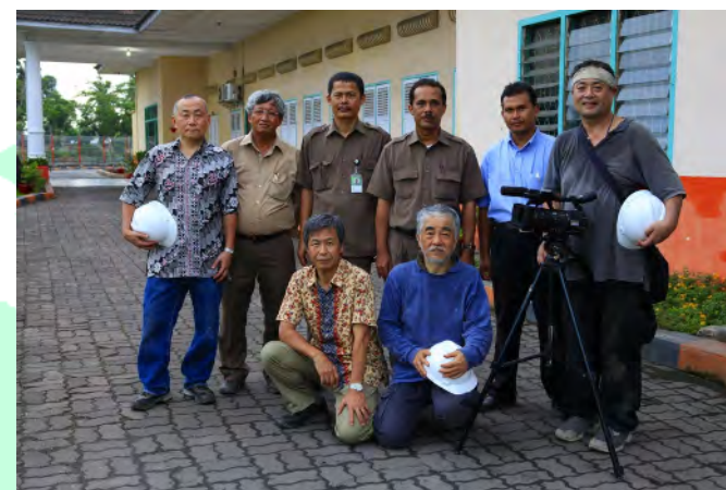
Movie shoot at Jalan Serdang, Perbaungan, PTPN IV Kebun Adolina